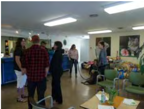
Below: Our "Spring Shower" and Open House event in May brought in many needed items for the new building.