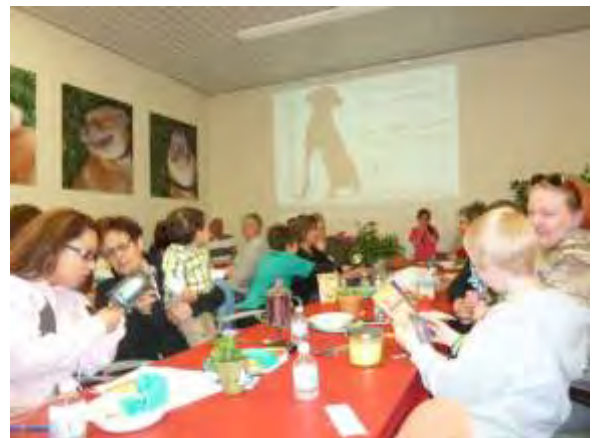
Above: Volunteer Appreciation luncheon in our new Community Education room.