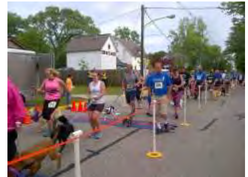
Right: Furry 5K participants cross the start/finish line with their four-legged partners at Kid's Corner Park.