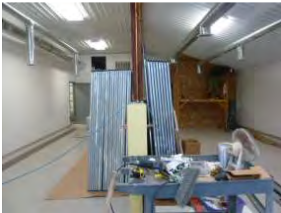
Above: Large dog kennel room. Equipment purchased through $10,000 anonymous grant, $5000 donation from Allegan Women Who Care and May 2:1 anonymous donor matching funds which raised $31,500. Installation soon.

We have been blessed to work with many local contractors who have donated in-kind materials and time, and appreciate "flexible billing." A big shout out to Richwood Contracting, Haven Heating, Roland Electric, and Kirk Thompson plumbing who have kept this project rolling. Over 200 individuals, businesses and organizations have contributed to our C.A.R.E.S. campaign. Thank you all from the bottom of our hearts. If you have not yet donated, please consider a donation now to help us reach the finish line. We also have some wonderful "Naming Opportunities" in our new building if you are interested in leaving a permanent legacy. We would love to welcome our adoptable animals into their new "temporary home" in 2018 as part of our 50 th anniversary celebration, and welcome you into the new Adoption and Community Education Center that will serve our community for the next 50 years!